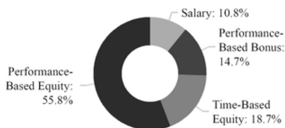
CEO Compensation Fiscal 2018